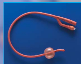
Red Rubber Coudé