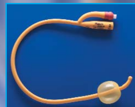
Rüsich Pure/Gold™ Coudé